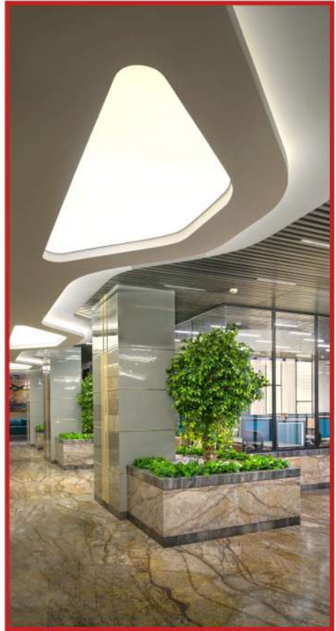
Translucent Fabric in Ceiling