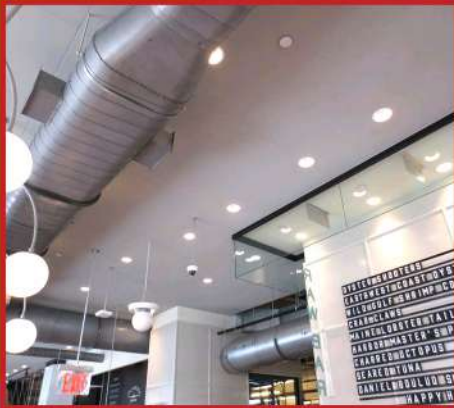
Acoustic Fabric in Ceiling