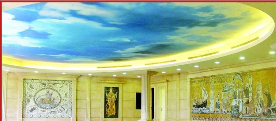
Printed Backlit in Ceiling