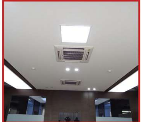
Opaque Fabric in Ceiling