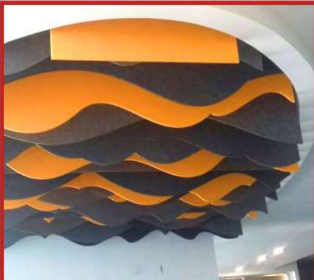
Dhwanik Acoustic Baffles