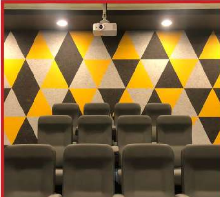
Dhwanik Panels on Walls