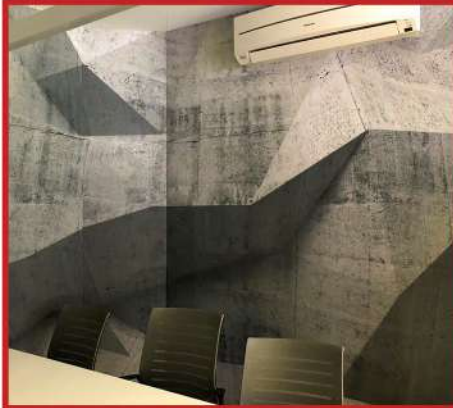
Acoustic Fabric on Walls